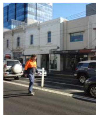
D. Facilitate Pedestrian Crossing of Bridge Road