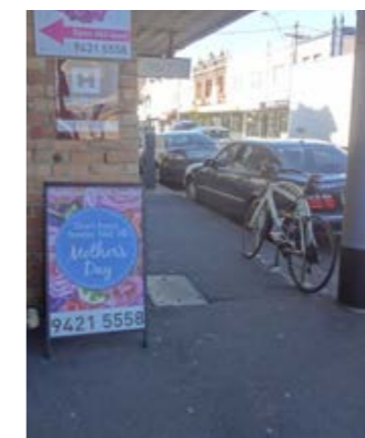
F. Widen the Northern Bridge Road Footpath