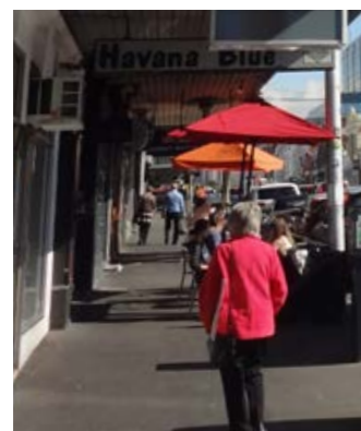
A. Make 'Richmond Hill' a place for people