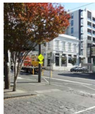
C. Prepare an Integrated Master Plan for Bridge Road Improvements