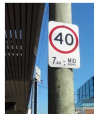
E. Slow Traffic on Bridge Road