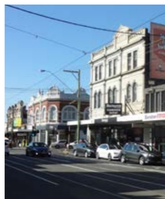
B. Acknowledge the Bridge Road - 'Richmond Hill' precinct as a Destination