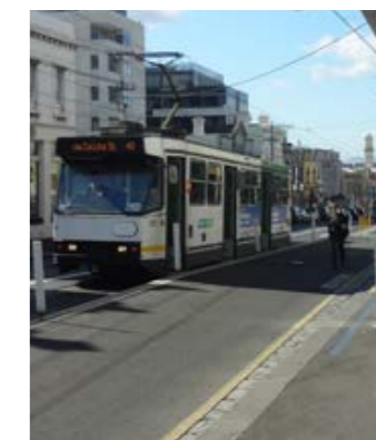
G. Share Space on Bridge Road