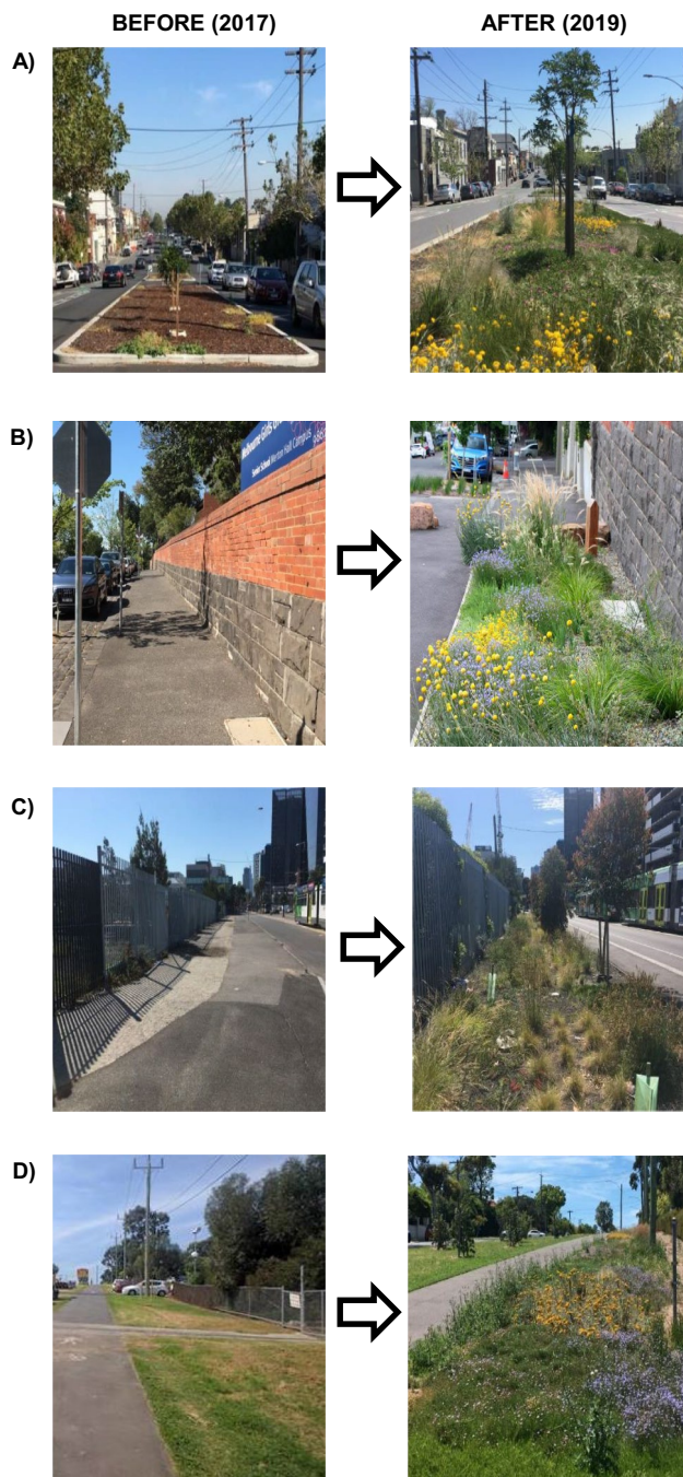
Fig. 2 Before (2017) and after (2019) photographs of the four ‘impact’ biodiverse streetscape planting sites (initial planting of sites occurred between April – June 2018), located at A) Arden Street, North Melbourne; B) Clowes Street, South Yarra; C) Docklands Drive, Docklands; and D) Park Street, Parkville

were available from suppliers at the time, and substitutions were made by the planting contractors without consultation with the internal project manager. In some cases, these substitutions were unsuitable for use or of poor quality, with many dying post-planting. This highlighted four key lessons: 1) species that are uncommon in cultivation, as many were, or are needed in large